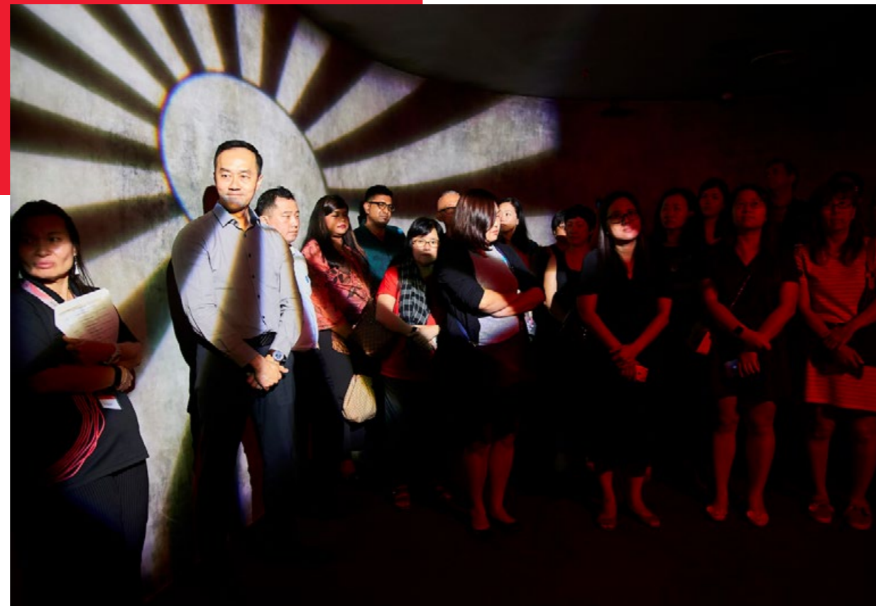
The resulting showcase was a cinematic journey that allowed visitors to experience history in person.